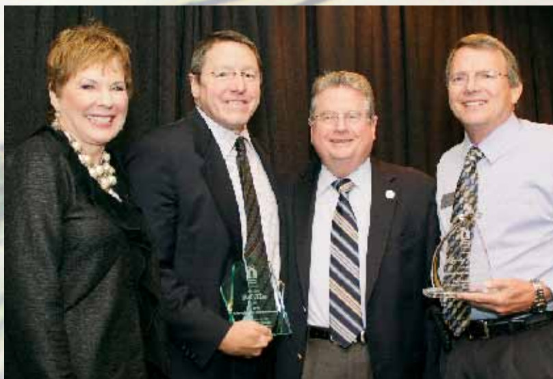
MAYOR WHEELER CONGRATULATES THE AWARD RECIPIENTS!